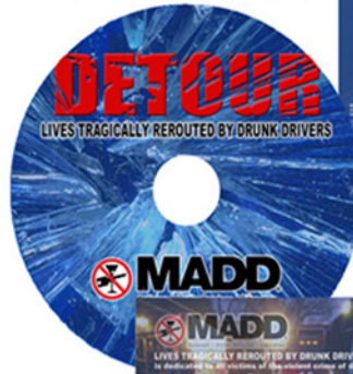
DVD & PACKAGING