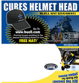
BUELL Promotional Mailer